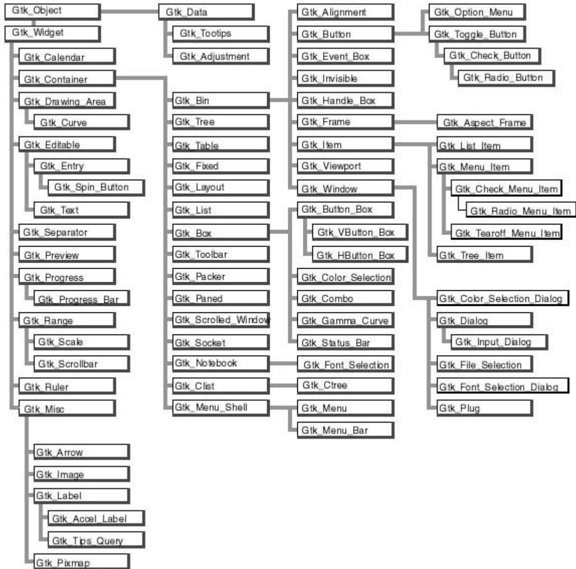
Fig. 1: Widgets Hierarchy